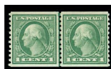
Guide line pair

WE'RE ON THE WEB! Wilkinsburgstampclub.com