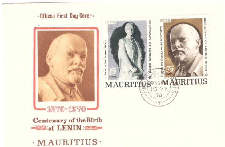
Centenary of Birth First Day Cover May 15th 1970

Mauritius issued two stamps to mark the birth centenary of Vladimir Ilyich Ulyanov, better known as Lenin, on 15 May 1970.