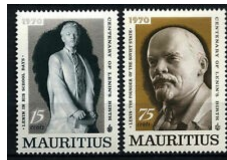
Stamp on left denotes Lenin as a student.

logically a Marxist, he developed political theories the architect of the Soviet state. He was the posthumous source of "Leninism," the doctrine codified and conjoined with Marx's works by Lenin's successors to form Marxism-Leninism, which became the Communist worldview. He has been regarded as the greatest revolutionary leader and thinker since Marx.